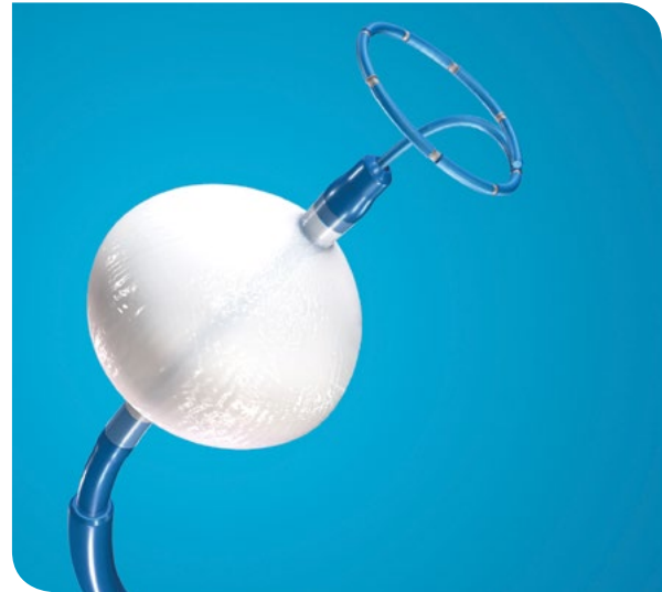
Cardiac cryoablation device

"Cryoablation's freezing technique has proven to be very effective in treating AF but also has other advantages such as being safer and quite painless compared to alternative treatments."